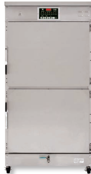
CAT529 CVAP® THERMALIZER OVEN WITH RACKS

CVap equipment complies with domestic and international requirements such as UL, C-UL, UL Sanitation, CE, MEA, and others.